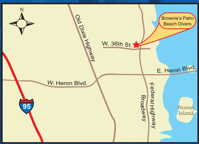
Take I-95 to Blue Heron Blvd east, north on Federal Hwy (Broadway), located on left with parking behind store

Brownie's Palm Beach Divers 3619 Federal Hwy, West Palm Beach, FL 33404 Ph 561.844.3483